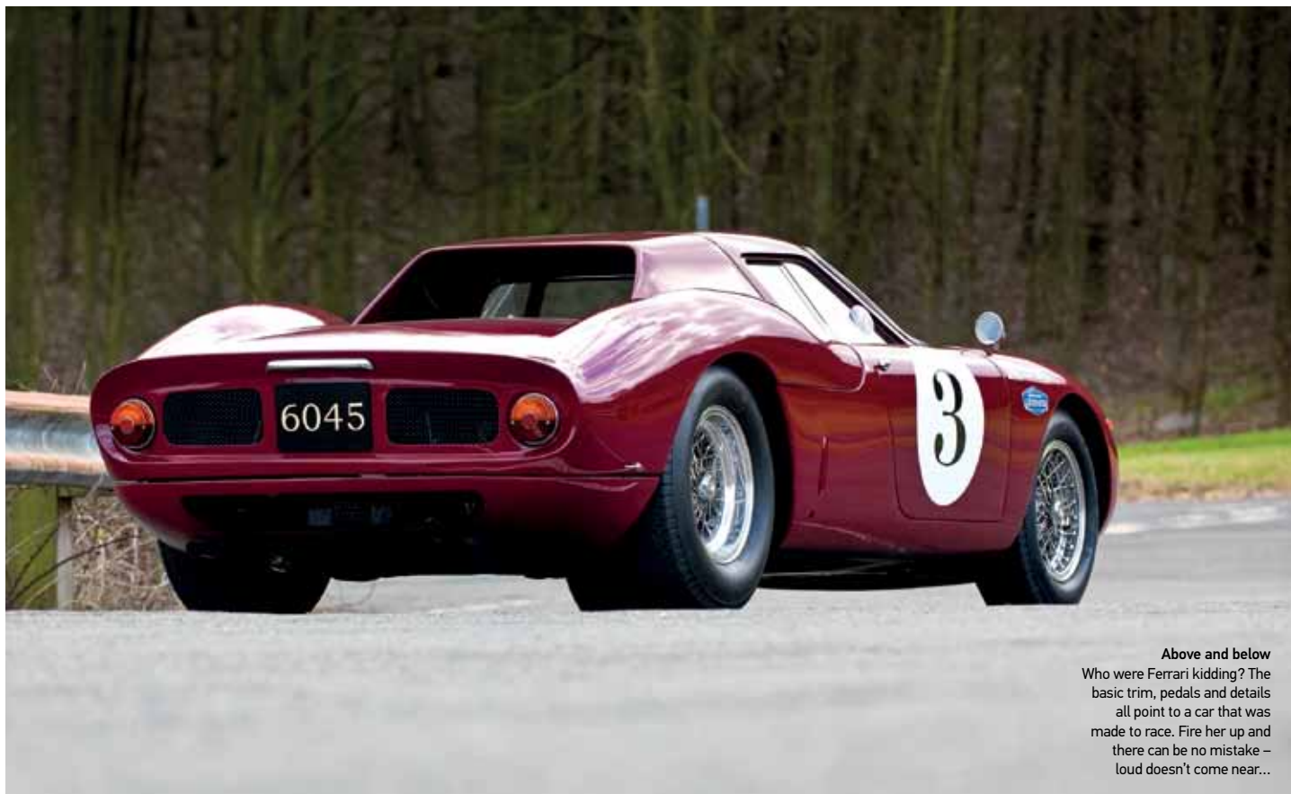
Above and below Who were Ferrari kidding? The basic trim, pedals and details all point to a car that was made to race. Fire her up and there can be no mistake – loud doesn't come near...

harder into tighter turns and there's mild understeer, but some way south of ten-tenths the handling inspires confidence. It merely demands a heightened degree of coordination from the driver than is customary with most supercars, even those from the Jurassic era.